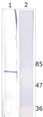
Figure 2. WB analysis of Huh-7 cell line expressing NS5B protein. Line 1. Huh-7 transfected with HCV replicon, Line 2. Huh-7 non-transfected cells.